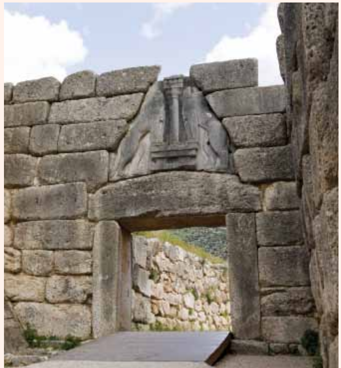
The Lion Gate of Mycenae.

Thursday, July 21 Disembark Sea Cloud II this morning in Piraeus and transfer to Athens Airport for your flight home, or continue to Athens for the optional postlude.