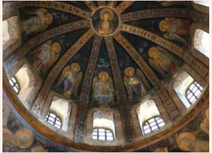
Church of the Savior in Chora.