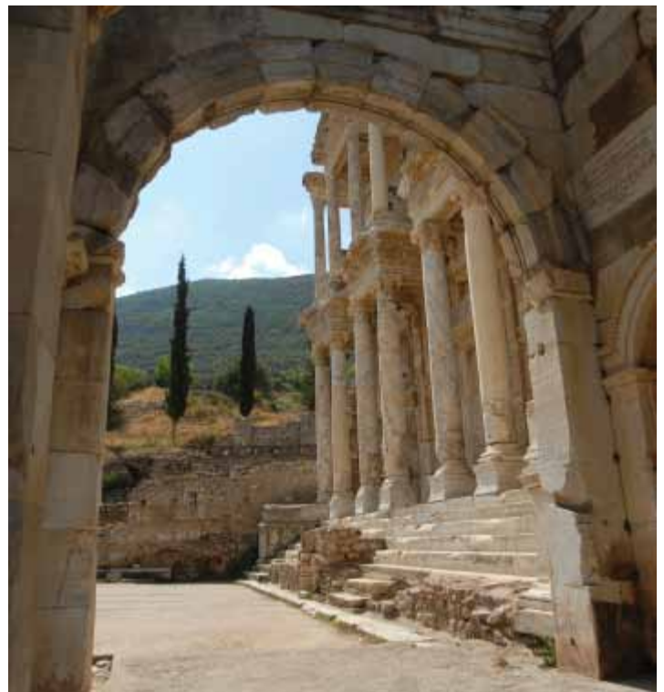
Library of Celsus, Ephesus.

gathered to hear poetry readings and music. Return to the ship for lunch. The afternoon is at leisure to enjoy the sights and shops of Kusadasi. In the evening, a special onboard performance by a quintet from the Izmir Philharmonic Orchestra is followed by dinner.