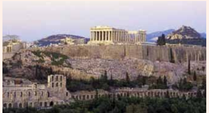
The Athens Acropolis.

Fly from New York to Istanbul for three nights at the historic Four Seasons Sultanahmet Hotel in the Old City. Explore Topkapi Palace, residence of the Ottoman sultans for over 400 years, visit the Museum of Turkish and Islamic Arts in the former Ibrahim Pasha Palace, and shop for spices, carpets and crafts at the Grand Bazaar. At the Archaeological Museum view the magnificent Alexander Sarcophagus, dating from the 4th century B.C.E. Other highlights include the 6th-century basilica of Hagia Sophia, the stunning tiled interior of the Blue Mosque and the exquisite mosaics at the Byzantine Church of the Savior in Chora. ♦