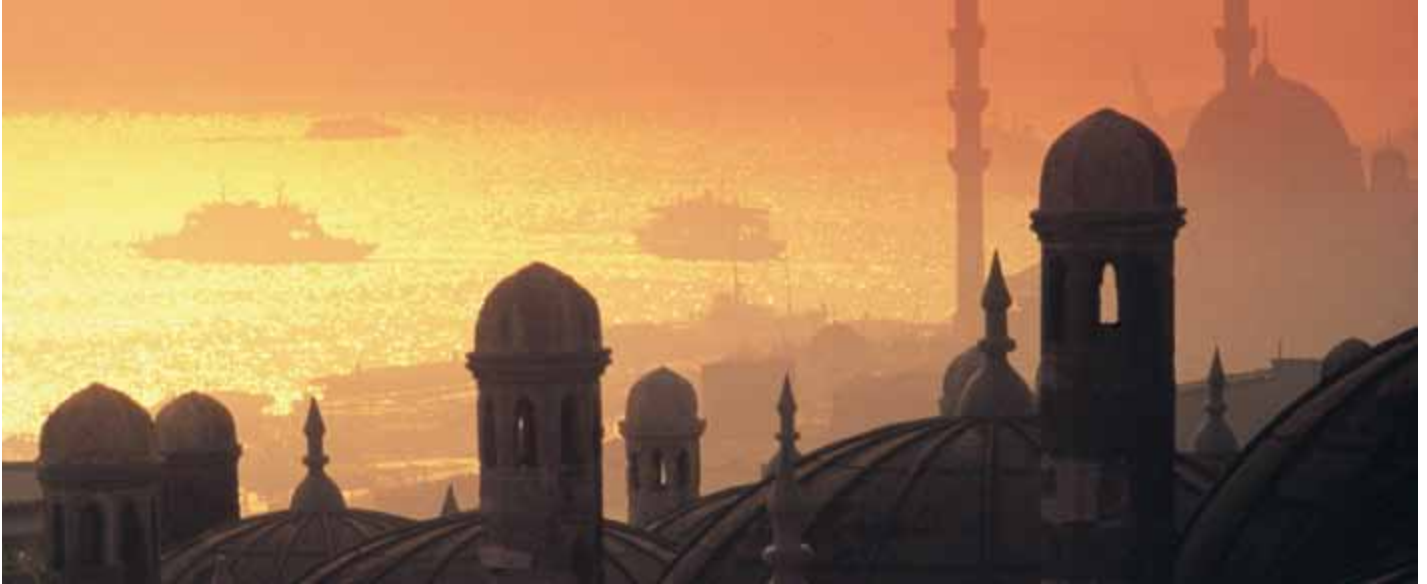
Istanbul and the Bosphorus at sunset.