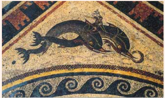
Dolphin mosaic, Delos.