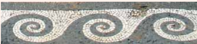
Villa floor mosaic detail, Delos.

Tuesday, July 19 Spend the morning on tiny Delos. Said to be the birthplace of Artemis and Apollo, this now uninhabited island is one of the most important archaeological sites in Greece. See the Sanctuary of Apollo and the theater, as well as public squares, shops and villas, many displaying superb mosaic work. Lunch on board is followed by a relaxing afternoon at sea and a teatime lecture.