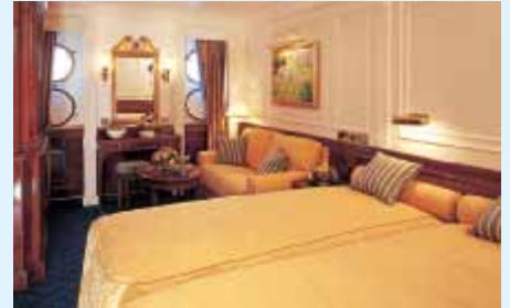
Owner's Suite (top) and a Deluxe Cabin on Cabin Deck (above).