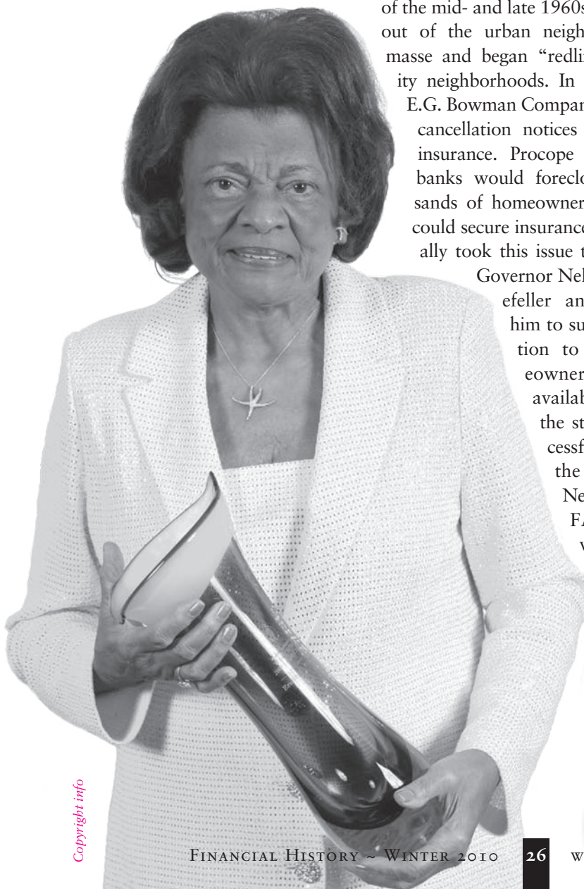
Left: Caption to come

In the 1980s and ’90s, Procope was named to many corporate and non-