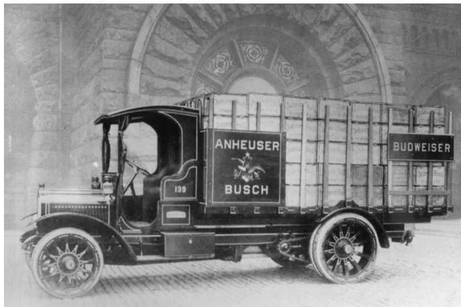
Saurer Co. Budweiser truck, ca. 1911-1917.

Nearly a year after Prohibition's repeal, 68-year-old August Sr. shot