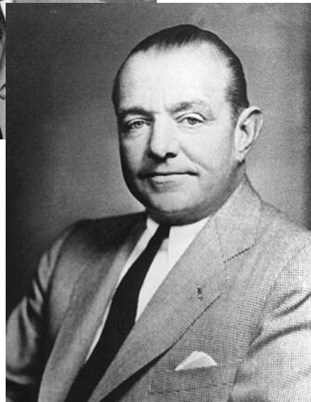
Top: Adolphus Busch Bottom: August A. Busch Jr.

For his time, Busch was undoubtedly an innovative beer promoter. As he traveled from tavern to tavern, he left a "calling card" that gave customers a memorable and long-lasting impression of his St. Louis brewery. It was a small jackknife with the E. Anheuser & Co. logo on the handle. At the end of the blade was a tiny picture of Adolphus Busch that could only be seen by looking through a peephole.